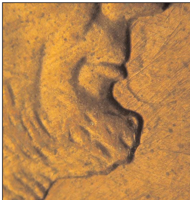
Extra profile of Lincoln