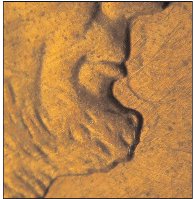
Above two photos courtesy of BJ Neff. The first shows the entire extra profile, while the close-up shows the mouth and chin.